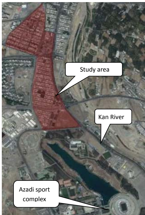
Fig. 2 The vicinity of study area to the important regions

The choice of selected study area is due to its vicinity to Kan River and Azadi sport complex (Fig. 2). In addition, urban drainage system implemented on study area, convey stormwater through concrete open channels network to Kan River (Fig. 3). Because of existing high impervious area, striking runoffs are introduced when extreme rainfalls occur. This would cause large amounts of runoff as well as urban flooding.